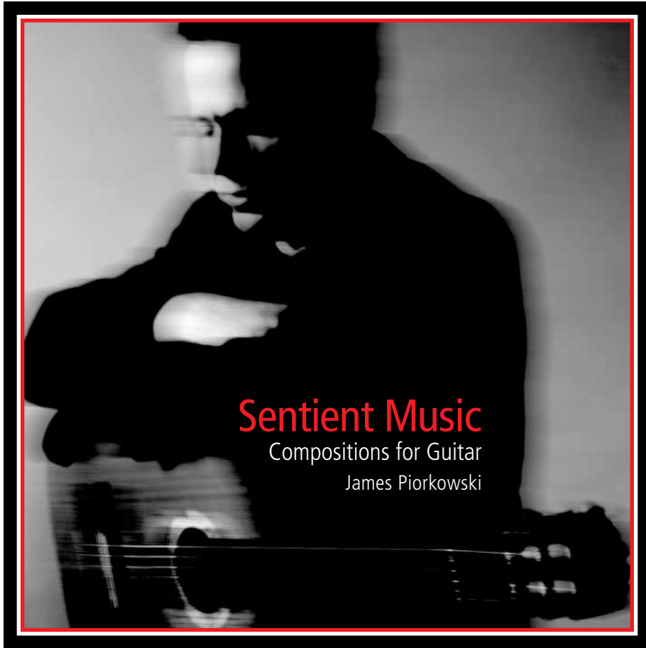
CD Cover, 2004 Photography and design Client: James Piorkowski