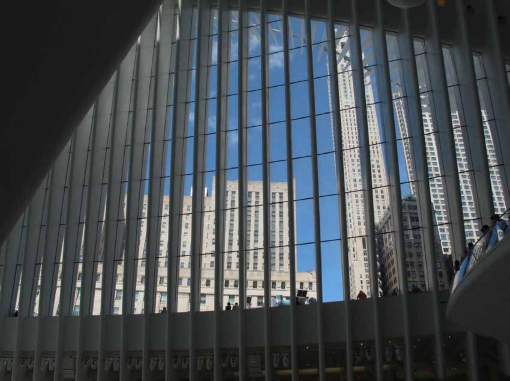
Oculus, New York City, 2017 Digital Photograph